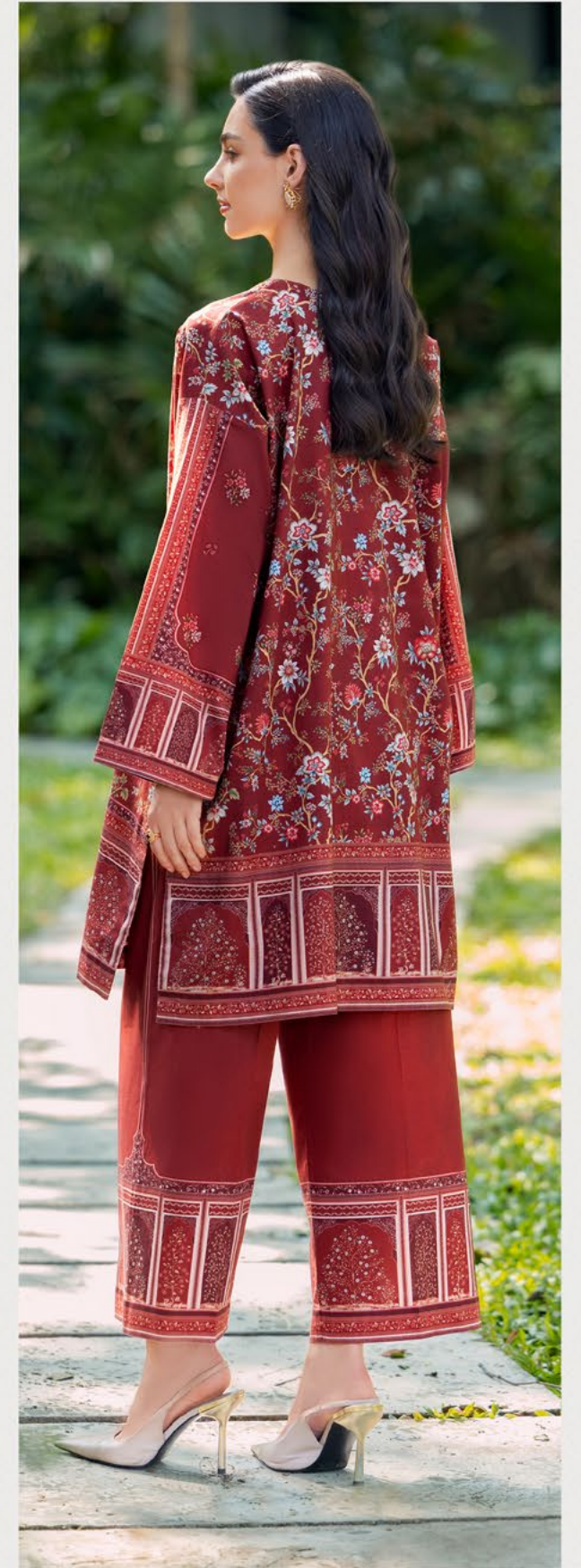
Zar BRPP-45 | 2 Piece | Lawn