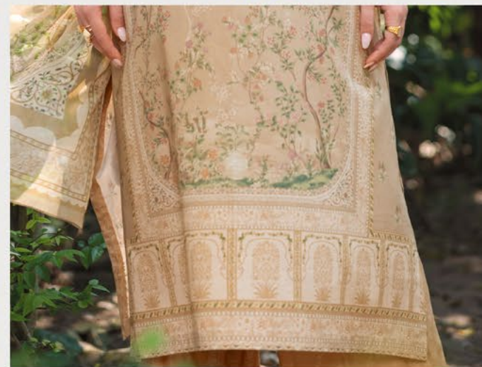
Petal Poem BRPP-57 | 3 Piece | Lawn