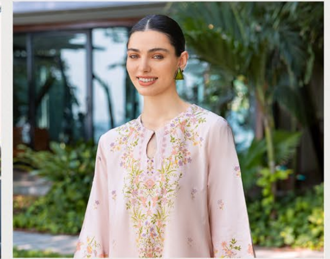
Blush Flora BRPP-53 | 3 Piece | Lawn