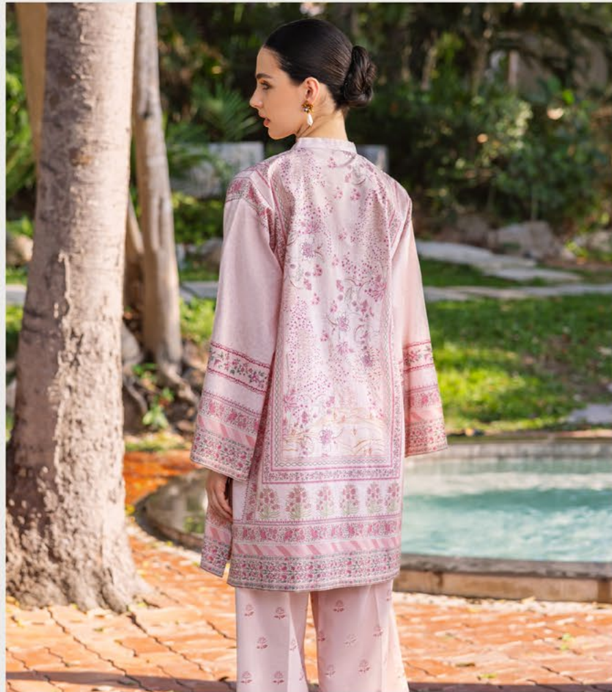
Serene Dew BRPP-59 | 3 Piece | Lawn