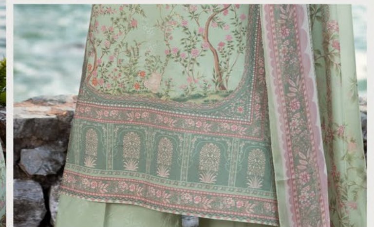
Petal Poem BRPP-58 | 3 Piece | Lawn