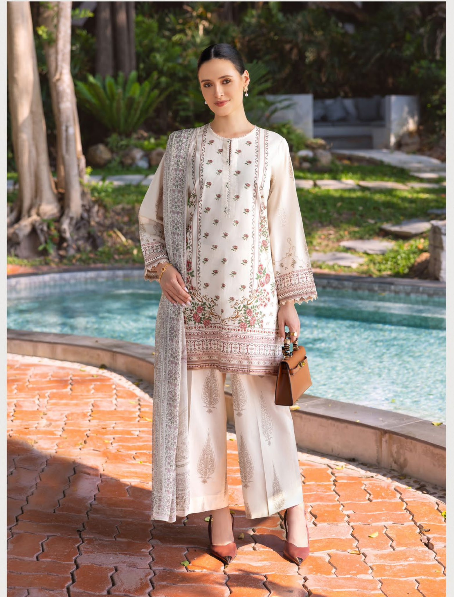
Morning Mist BRPP-51 | 3 Piece | Lawn