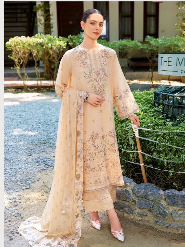
Blush Flora BRPP-54 | 3 Piece | Lawn