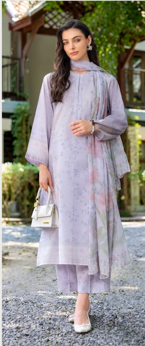
Pure Petal BRPP-55 | 3 Piece | Lawn